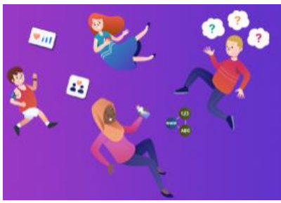
Health and Wellbeing