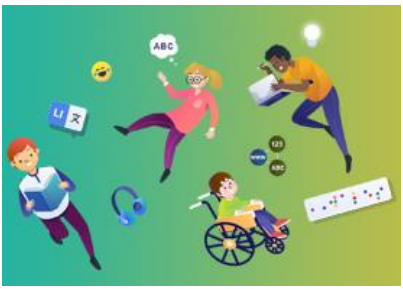
Languages, Literacy and Communication