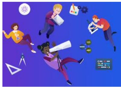
Science and Technology