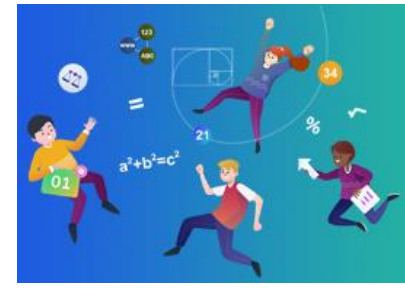
Mathematics and Numeracy