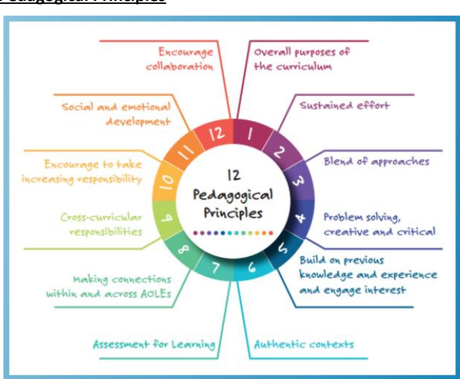
The 12 Pedagogical Principles

We constantly reflect upon, share and develop our teaching practises based on our understanding of the 12 pedagogical principles set out in the curriculum framework and the practises we find successful in our school, across the Federation, in our network of small schools and within our consortium to ensure the highest possible quality of learning experiences and teaching for our learners.